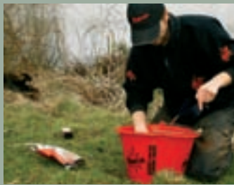
05 Now leave for 20 minutes and add more water to make the groundbait damper still.