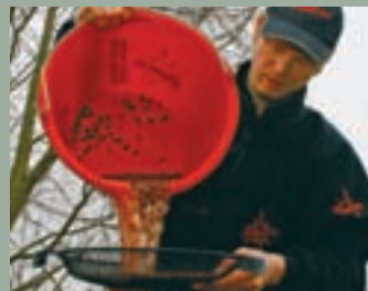
02 Now pour the water plus pellets through a maggot riddle.