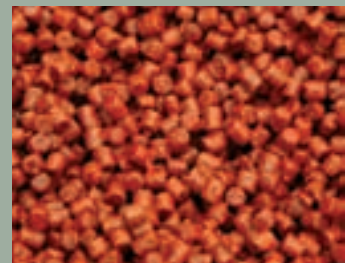
03 Nicely wet and ready for feeding.