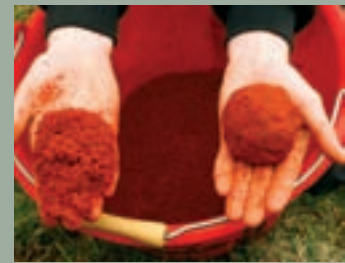
07 The finished groundbait should squeeze easily into a ball.