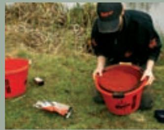
06 Pass the mixed groundbait through a groundbait riddle into another bowl.