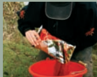
02 Pour the bag of dry groundbait into your mixing bowl or bucket.