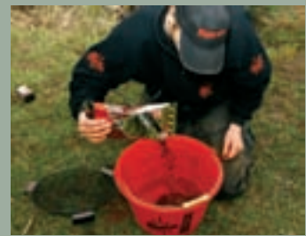
01 Pour your pellets into water in your bait bowl or bucket.