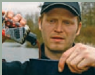
01 Pour a good squirt of The Source liquid into a water-filled container.